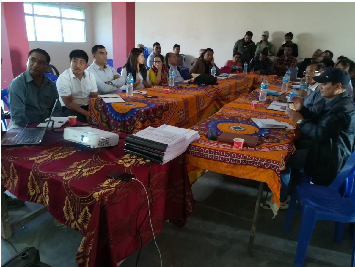
ADB Loan Review Mission meeting at Suklaphanta municipality