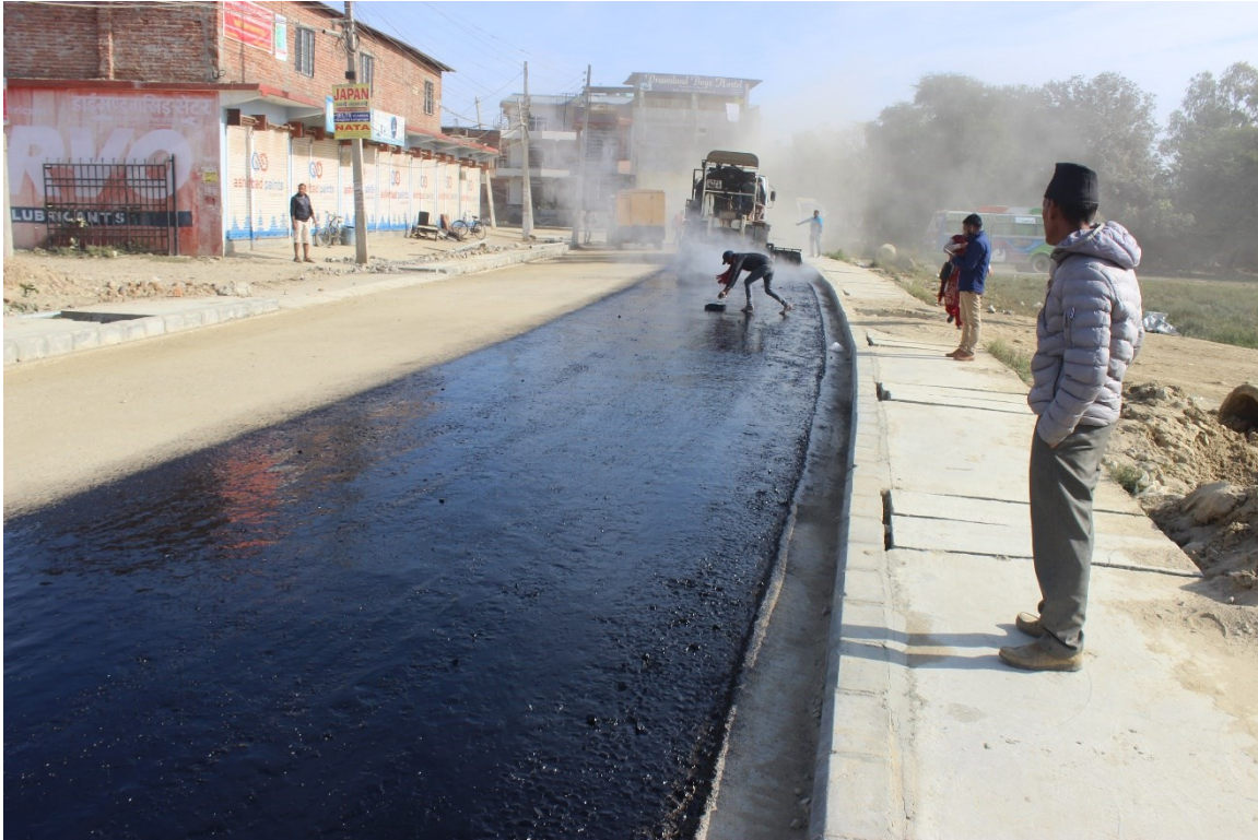
Prime work in progress at Karkanda-Bypass Road, Nepalgunj