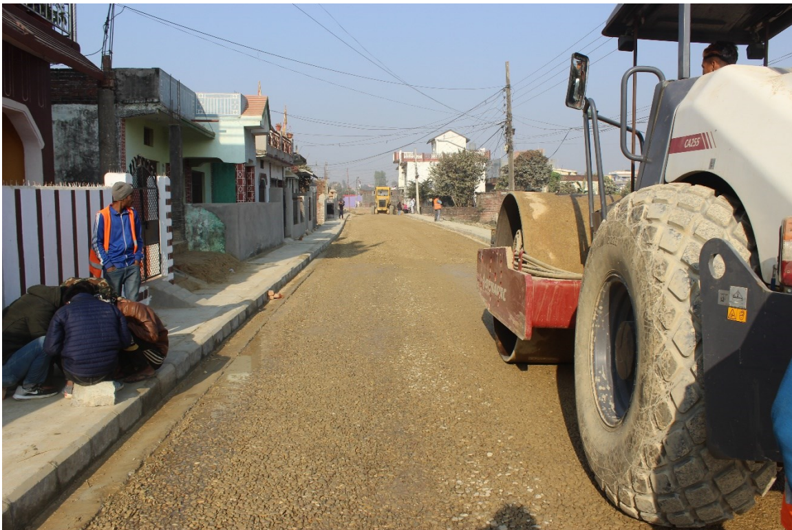
Base Course Finishing work at Karkanda Road, Nepalgunj