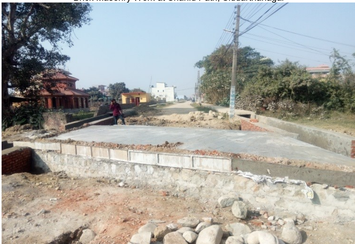
Slab Culvert work at Durga Colony road, Siddharthanagar