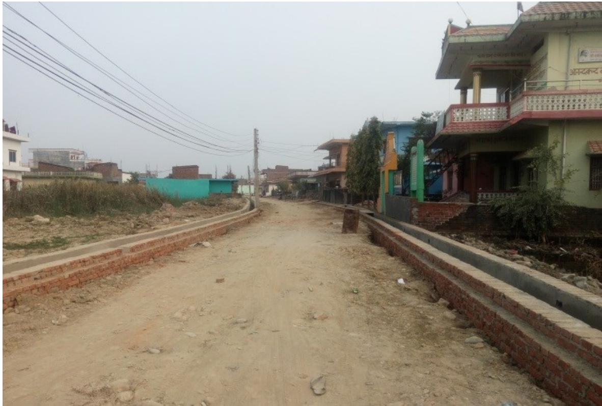
Brick Masonry Work at Shahid Path, Siddharthanagar