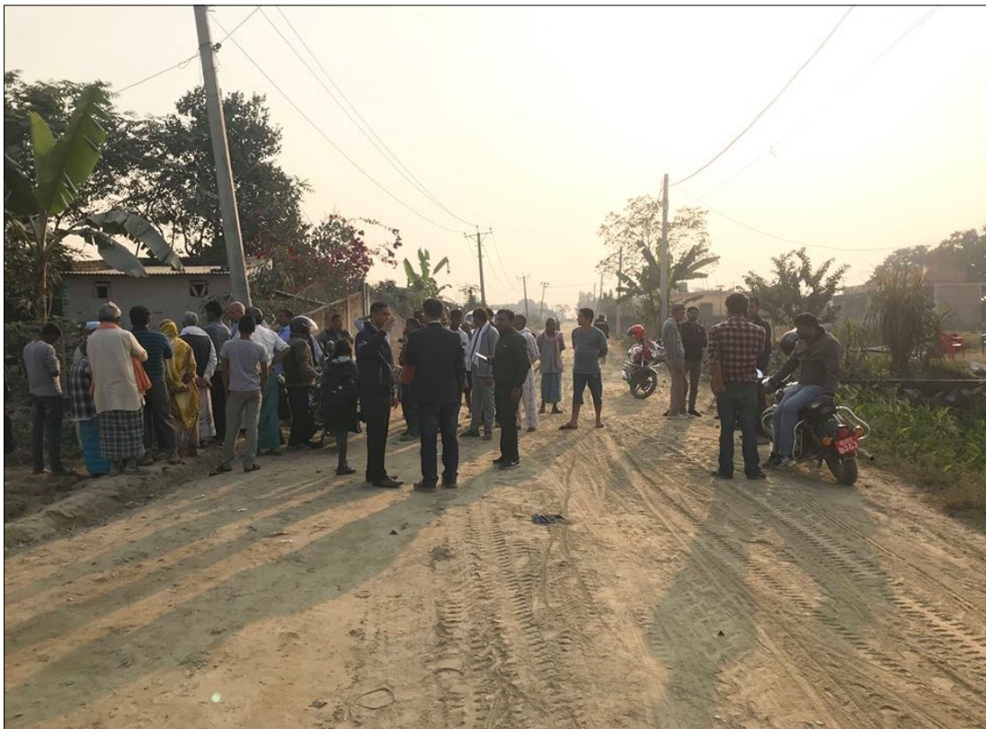
Consultation with local people before clearance of ROW, Birgunj