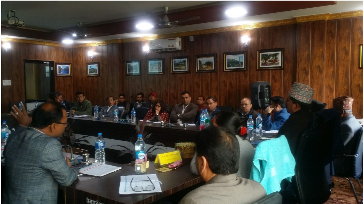
ADB Loan Review Meeting at Bheemdutt Municipality