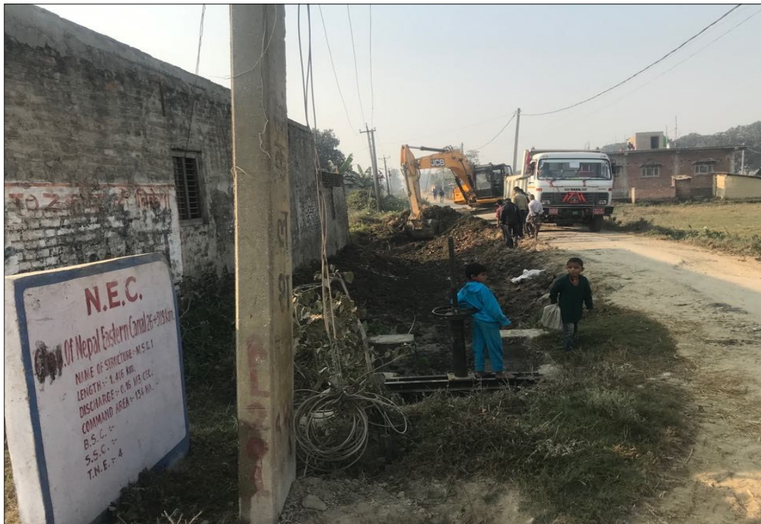
Clearance of ROW, Birgunj