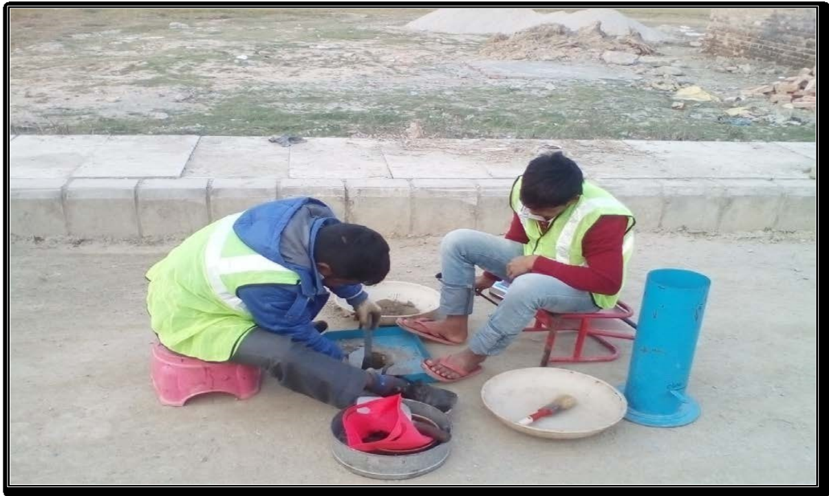
Field Density test at R3 (Dharamban Road), Biratnagar