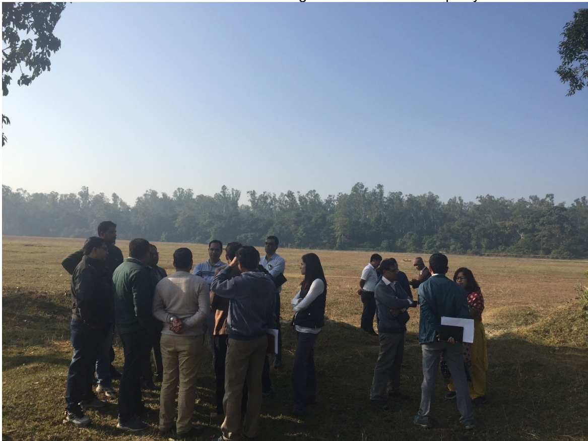
Dhangadi ISWM site visit by ADB loan review mission